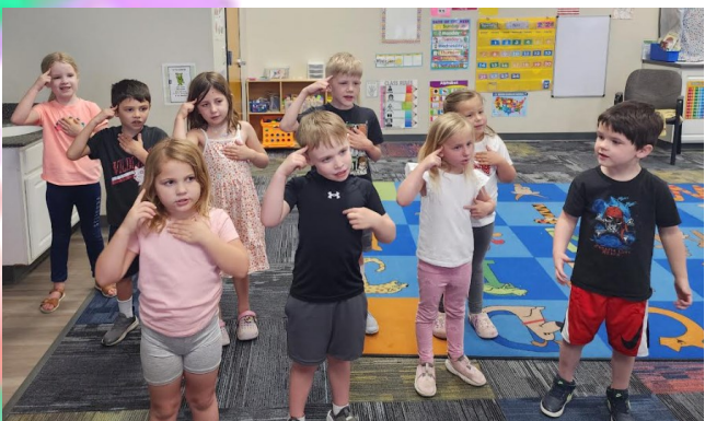
The Daisies & Snapdragons classes practice for graduation. The groups have both worked very hard to get ready for their special day, May 14. We are excited to celebrate all their accomplishments.

The sounds of singing are drifting down the hallway and it's starting to get warmer, which can only mean one thing — May and pre-k graduation are on the horizon! We are so excited for all the fun events that May kicks off at the center.